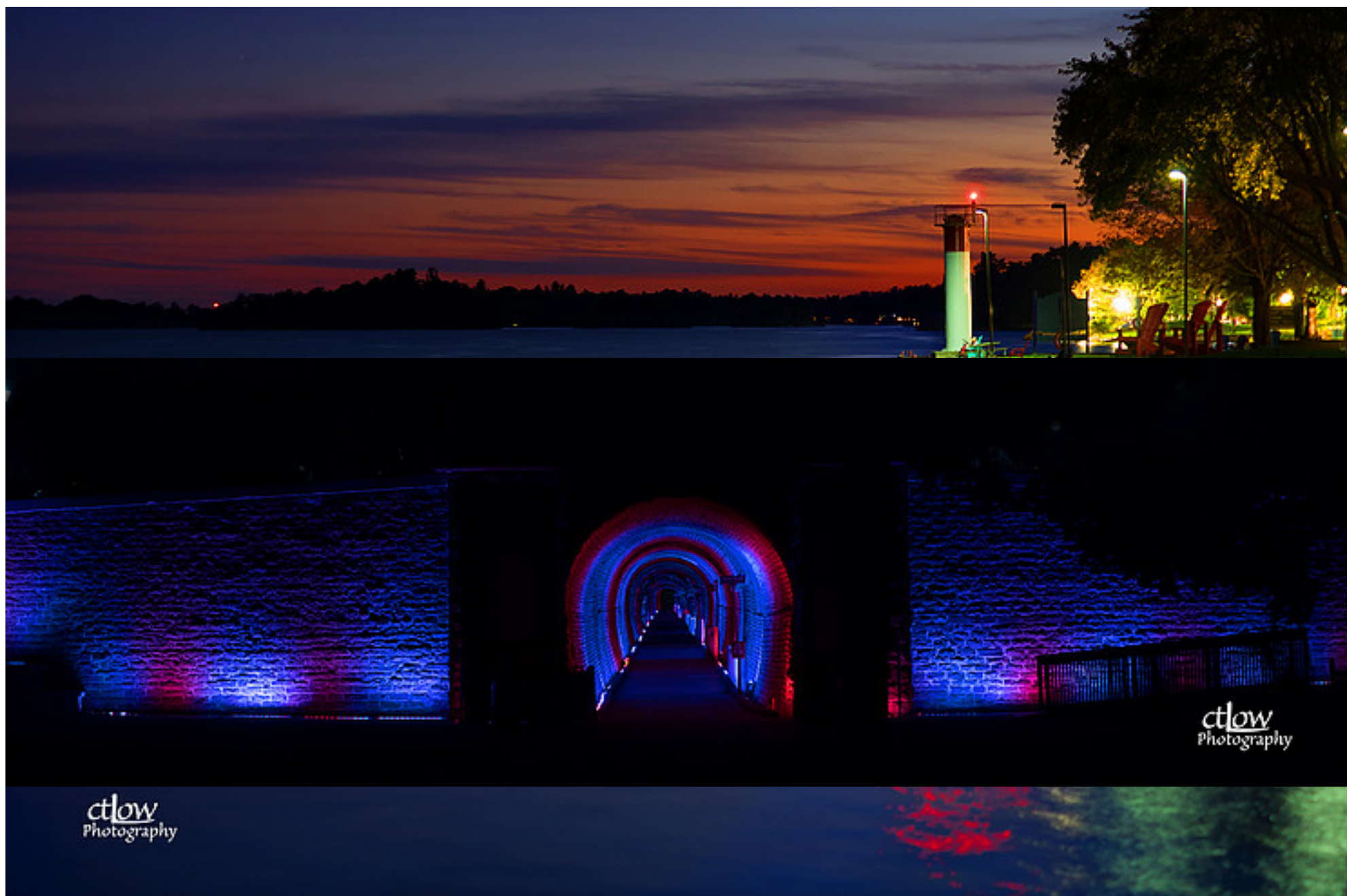
Sunset from Blockhouse Island

Things happened! I was helping another photographer with a thorny technical problem when I realized that he had found a scene which I had missed.