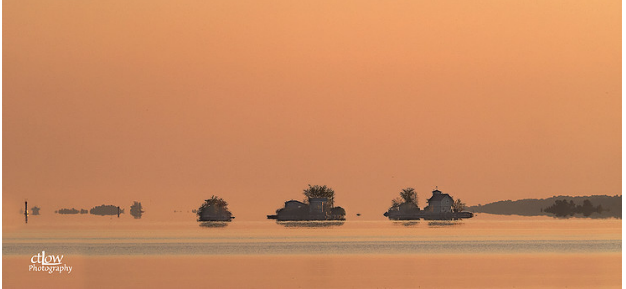
Three of the Thousand Islands, Ontario, Canada, through heat-shimmer at sunrise

Sales: most of the works you see in this blog or in my Art portfolio are for sale, and it is most emphatically not too early to think about the gift-giving season. For display in your home, or someone else's, or in your place of business, I would be most pleased to discuss that with you - or a specific commission which you might have in mind.