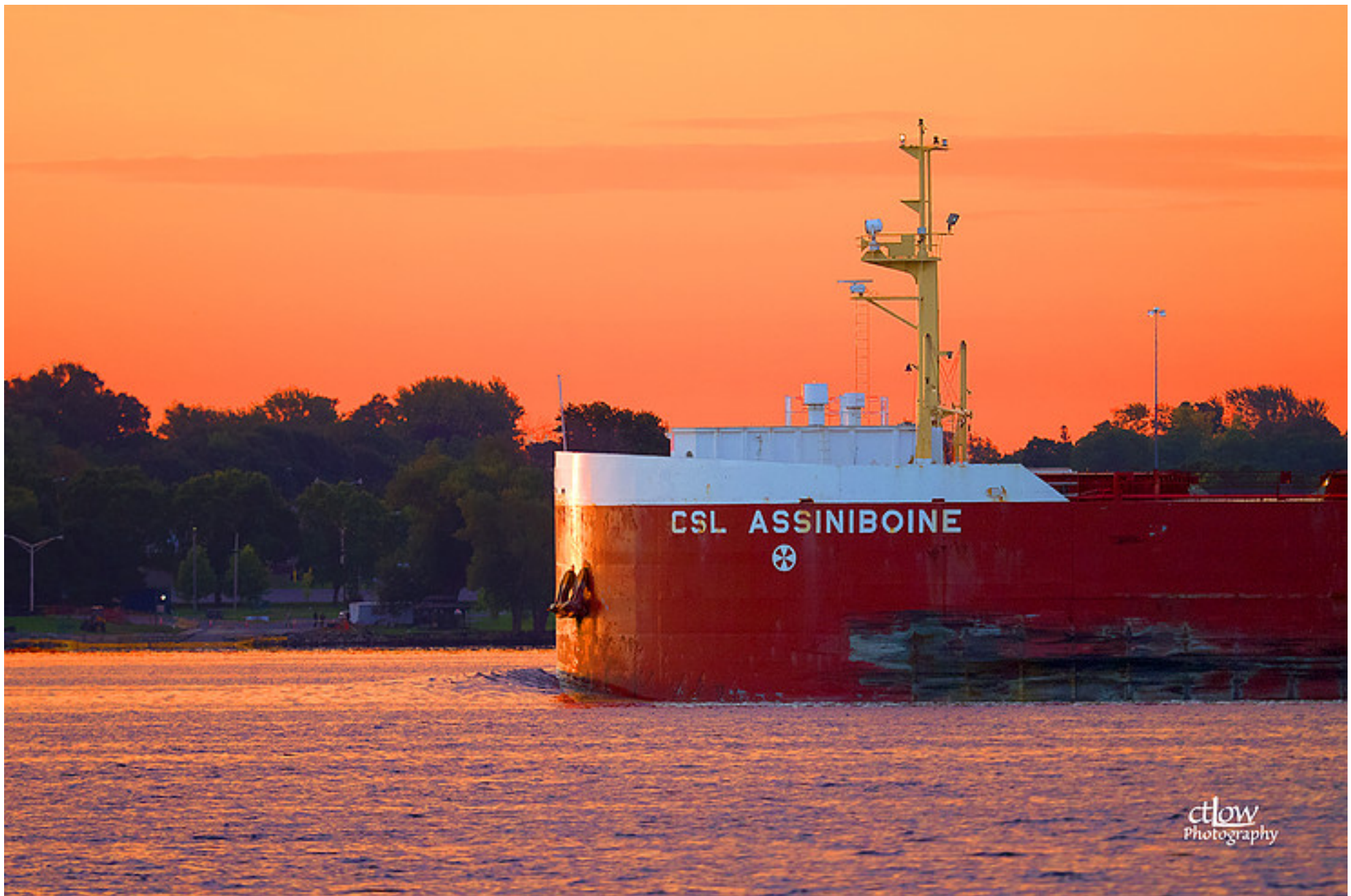
CSL Assiniboine, downbound at Prescott

Hanging around the St. Lawrence River as I do, freighters go by, and I continue to expand my collection, this being but one example.